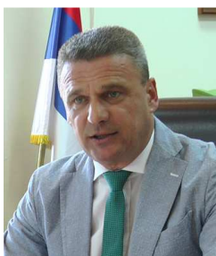
Milun Todorović President of OC Mayor of Cacak