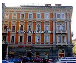
Novo hotel Impero