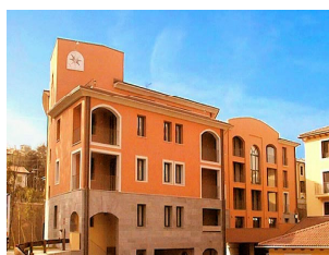
hotel San Rocco