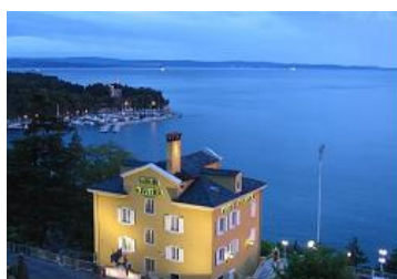
hotel Riviera & Maximilian's