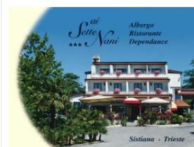
hotel Ai Sette Nani